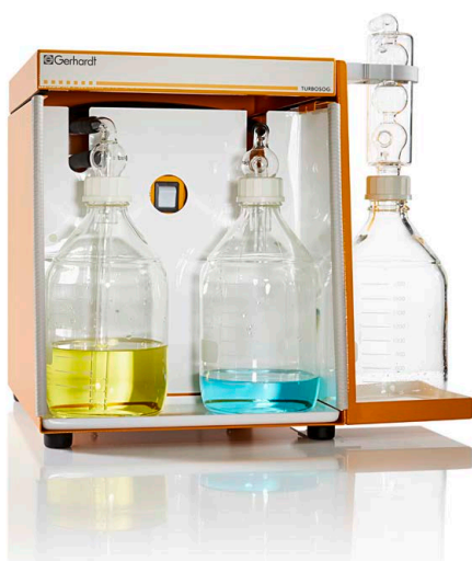
TURBOSOG with additional cooling unit ZKE

Powerful suction washer in tried and tested C- Gerhardt quality for extraction and washing out of the inorganic acid fumes created during digestion.