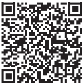
Scan the QR code and watch our FIBRE THERM® video.

“FIBRE THERM® standardises fibre analysis in feedstuffs, reaching a new level of quality, making it more economical, more precise and more reliable.”