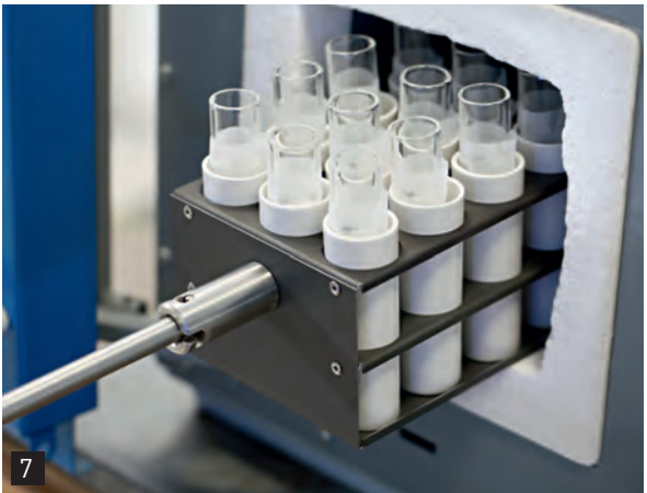
The incinerating module with a long handle makes handling of samples easier.