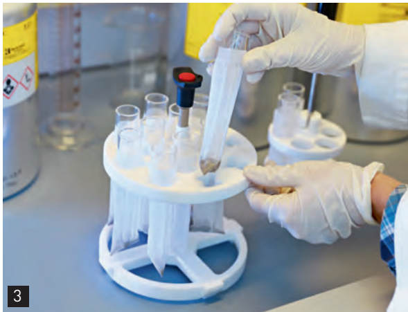
When the FibreBags are inserted into the sample carousel, they are automatically clamped firmly in place.