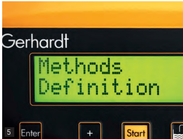
9 different methods can be freely configured and saved.