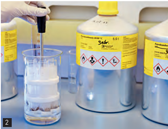
Convenient, time-saving degreasing with solvents in the degreasing module. 6 samples can be treated at the same time.