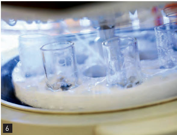
The rotating sample carousel ensures optimum bathing of the sample. The rotation is generated by the jet of detergent.