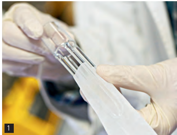
Easy handling: Insert FibreBag, weigh sample and you're ready. No need to seal the filter bag.