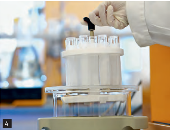
The removable handle makes it easier to insert and remove the sample carousel.