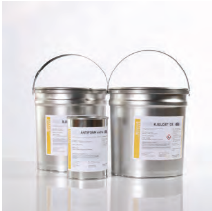
KJELCAT catalysts and anti-foaming tablets