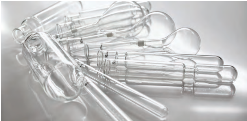
Digestion tubes and Kjeldahl flasks

“The variety of our accessories range is unsurpassed. We can satisfy any requirement.”