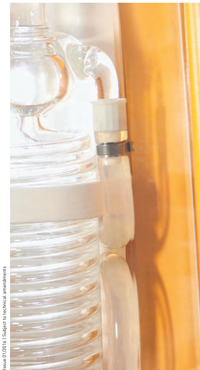
Issue 01/2016 | Subject to technical amendments