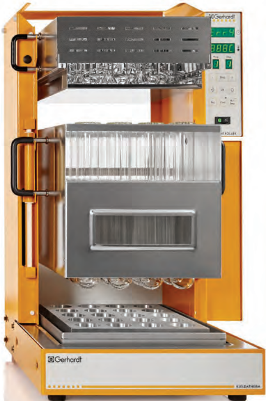
For example KBL 20S TZ

Both heating systems can be ideally combined with the effective TURBOSOG gas scrubber for all digestion units.