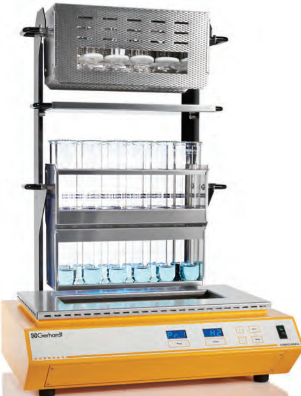
For example TT 125